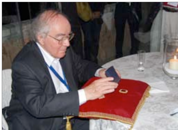
Martin Fleischmann admires the medal presented to him.