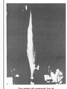
Two meter tall supersonic fog jet