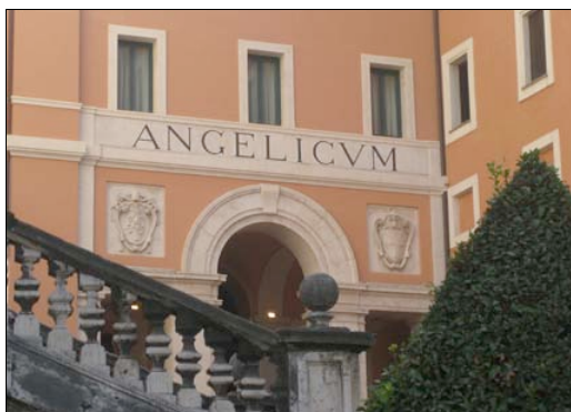
The exterior of Angelicum University.