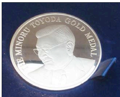
The Minoru Toyoda Gold Medal