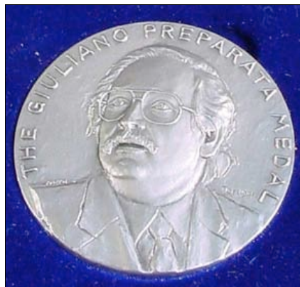
The Preparata Medal of the ISCMNS